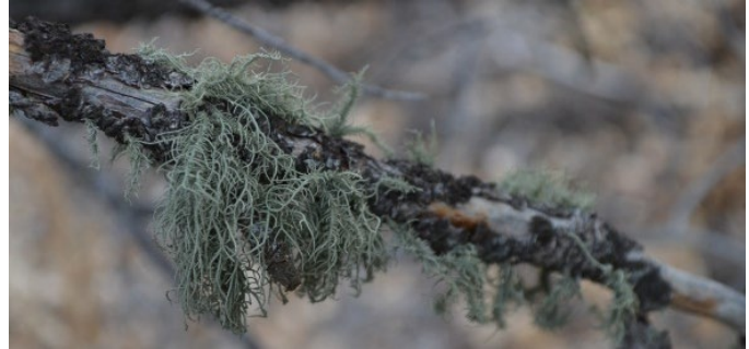
Western Beard Lichen