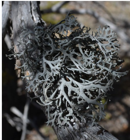
Western Antler Lichen