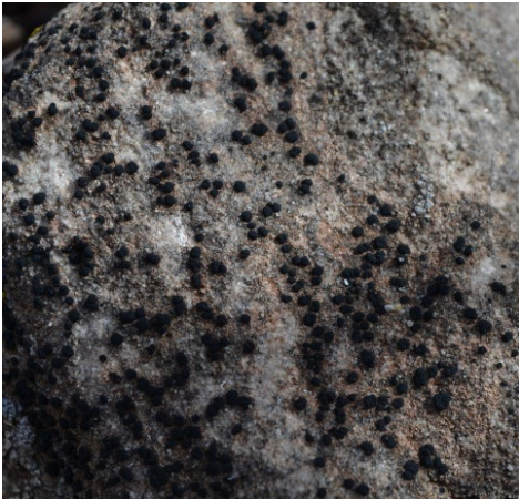
Single-Spored Map Lichen