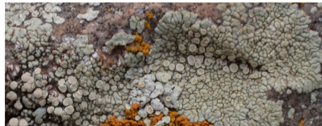
Smoky Rim Lichen