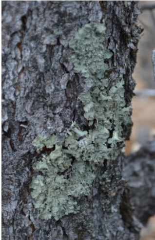
Speckled Greenshield Lichen