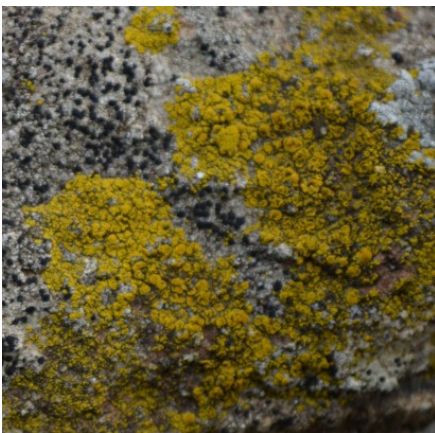
Gold Cobblestone Lichen