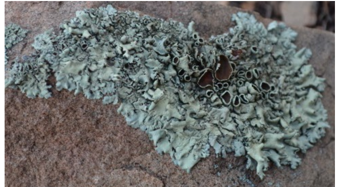
Frosted Rosette Lichen