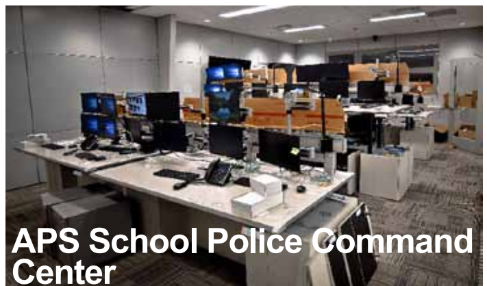
APS School Police Command Center