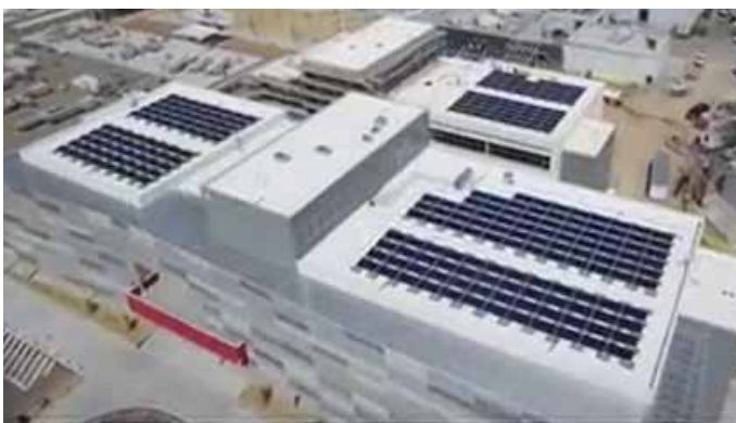
PV panels on the roof of an APS school.

The District's 2.2 megawatts of solar energy yields roughly 3,750 megawatt hours of electricity per year!