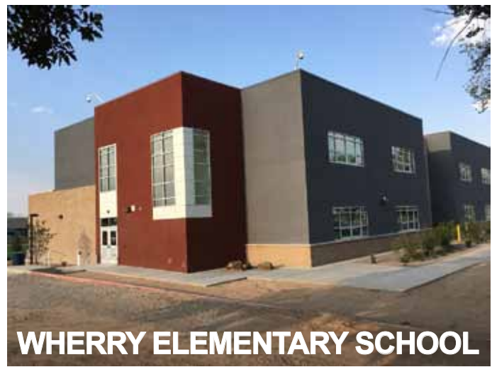
WHERRY ELEMENTARY SCHOOL

The NEW school is a total of 38,211 sq.ft.