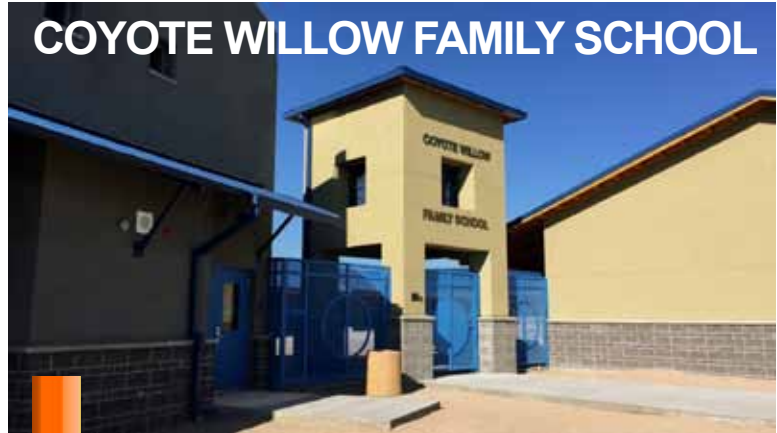
COYOTE WILLOW FAMILY SCHOOL

The NEW school is a total of 38,211 sq.ft.