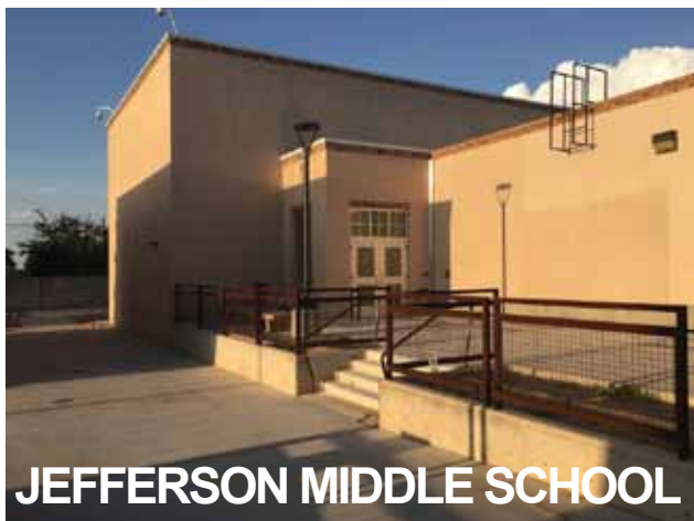
JEFFERSON MIDDLE SCHOOL

The new music classroom added 9,766 sq.ft.