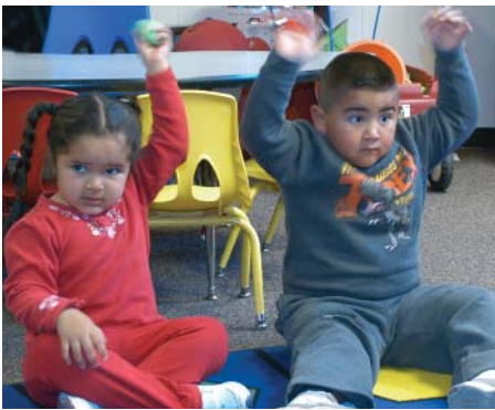
Pre-schoolers learn about rhythm.