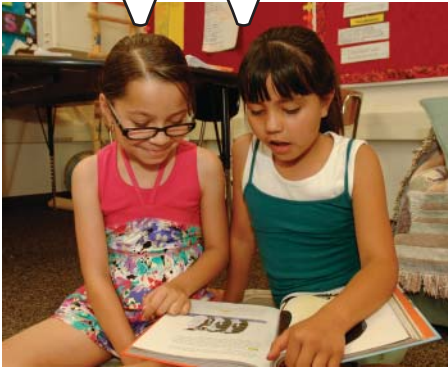
Many Horizon awards go toward literacy.