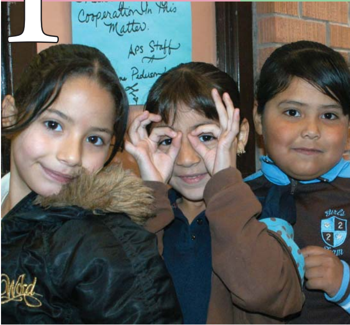
Elementary students prepare to get free eye exams at school.

In addition to the Horizon Awards , the Foundation also aids other district programs. In 2010-11, the Foundation gave $20,000 to Join-A-School's Seeds of Learning Grants, which are awarded to teachers in support of classroom programs or costs they've incurred in making kids' educational experiences more rewarding.