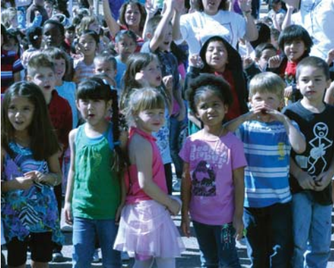
The beneficiaries of the Foundation's efforts are the 90,000+ students in APS.