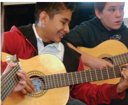
Music in schools gets Foundation support.

In 2010-11, the Foundation granted more than $70,000 to teachers to help fund projects through the Horizon Awards program.