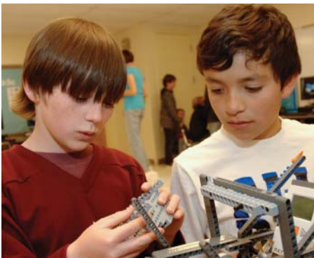
STEM projects can include robotics.