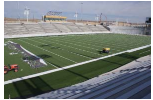
The new Community Stadium on the West Side opens in fall 2013.