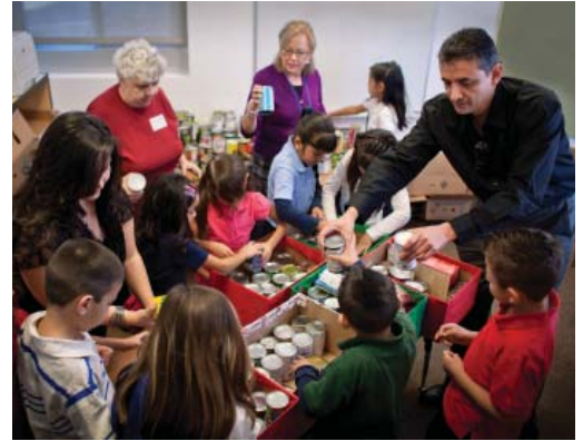
Antigua ES classroom weekly during National Discover Languages Month to work with first graders.

And, sometimes, we need to help our own students: