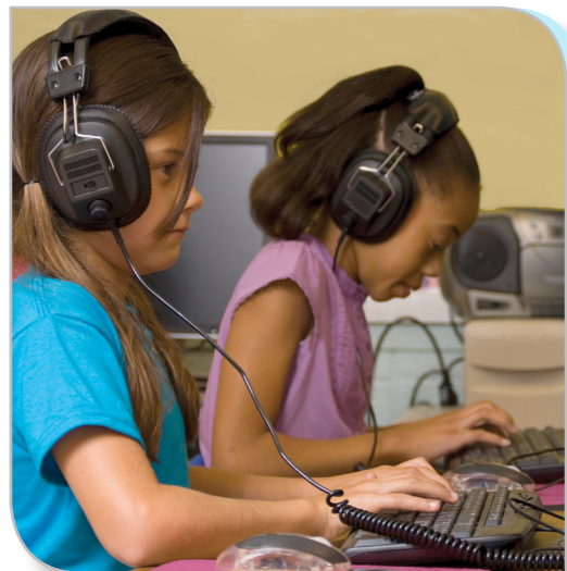
Accessibility features and accommodations allow more students to participate in the PARCC assessments.