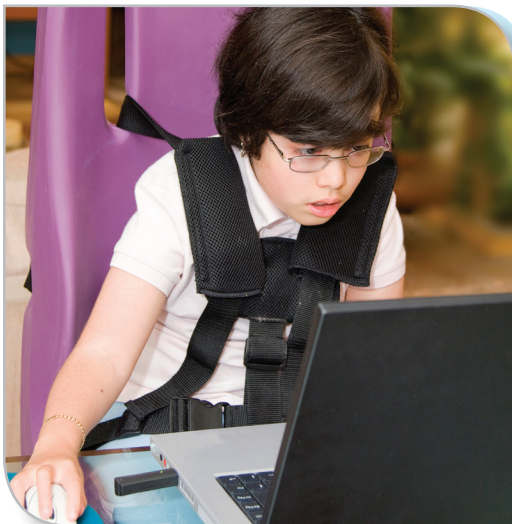
Accessibility features and accommodations allow more students to participate in the PARCC assessments.

tools. Remember: Students should not use an accommodation for the first time on a PARCC assessment.