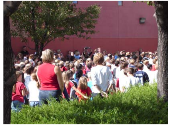
Quite a crowd came out for the Birthday Bash..