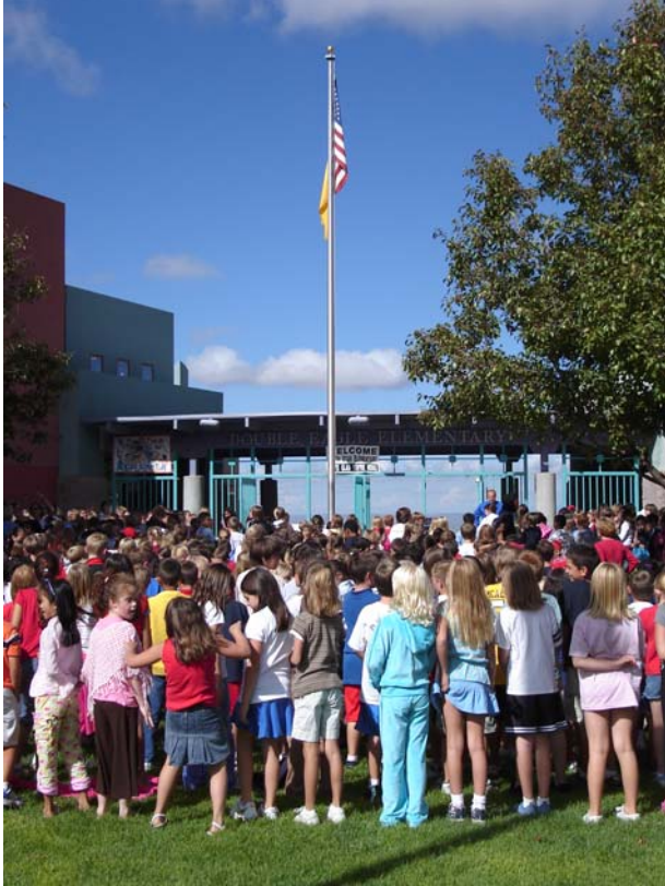
Children, Staff, and Parents gather around the Double Eagle Flagpole to celebrate our National Anthem's 192nd Birthday.