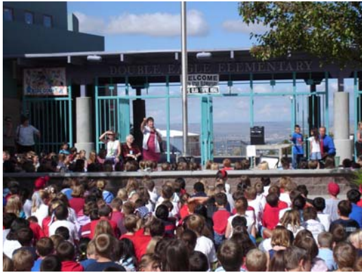
The crowd listens to guest speakers at assembly.